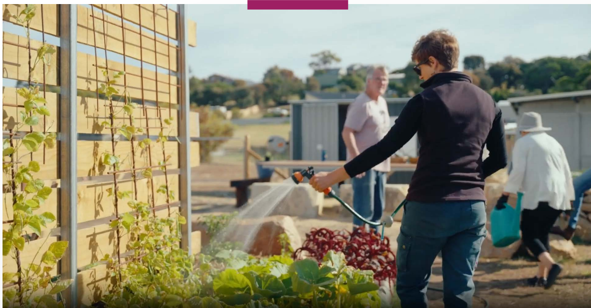
Swanwick Community Association - Community Garden Creating a new community garden in Swanwick