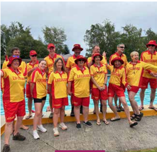
Royal Life Saving Tasmania - Mole Creek Pool Training 14 new volunteer lifeguards to reopen the community pool

Through the Community Grants Program, we empower the community to take proactive measures to enhance community resilience or to tackle the challenges posed by rising cost-of-living. We are collectively building a stronger and more prepared Tasmania for the future.