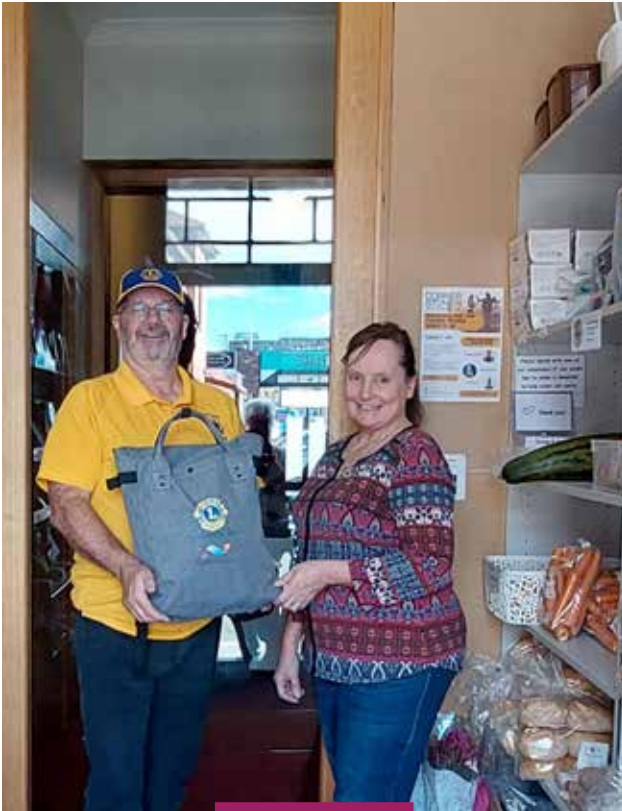
Riverside Lions Club - RESIPacks Delivering 50 backpacks of essentials to homeless individuals