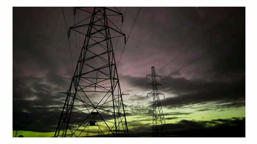
Photo of the Palmerston to Hadspen transmission corridor during the largest geomagnetic storm in 21 years, which lit up the sky with a beautiful aurora display earlier this month.

The developments will support our renewable energy future.