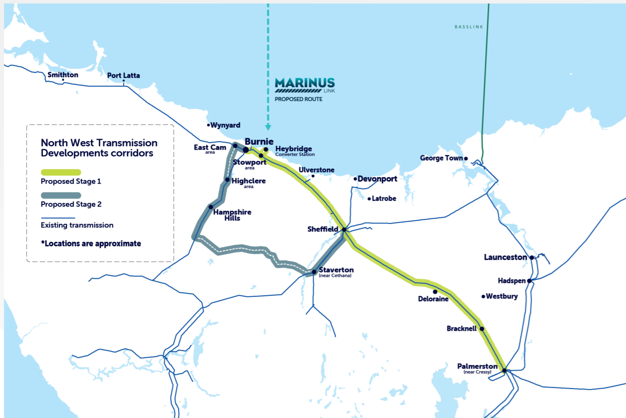
Figure 1: The NWT D project will be delivered in two stages