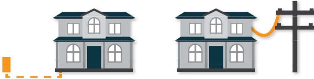
Figure 1 – Basic connection

TasNetworks is required to provide a connection offer to a connection applicant within 10 business days of the connection applicant submitting a satisfactorily completed application form.